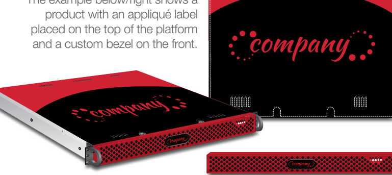
Example of a custom bezel