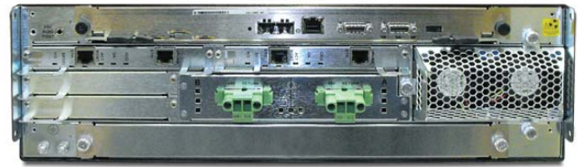
A-3000 DC Power, Rear View