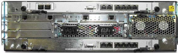
A-3000 AC Power, Rear View